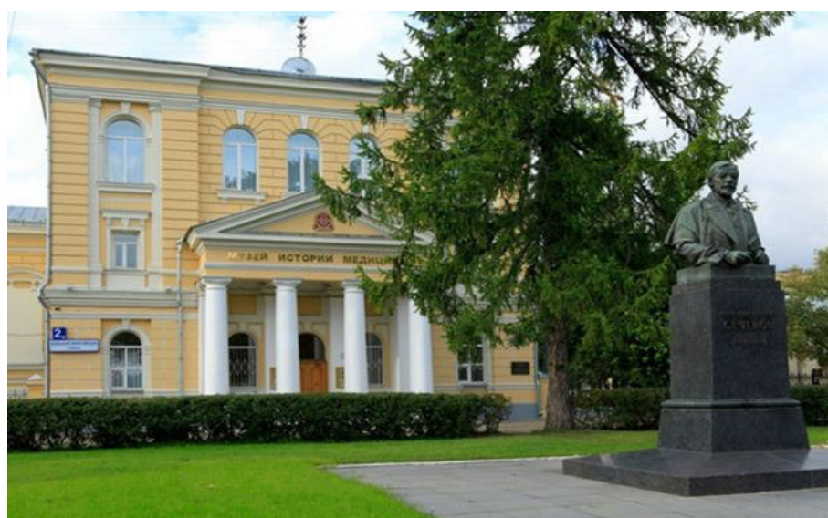
Fig. 5 Monument-bust to Ivan Mikhailovich Sechenov near the First Moscow Medical University