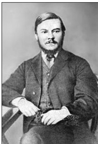
Fig. 1 Sechenov in his youth